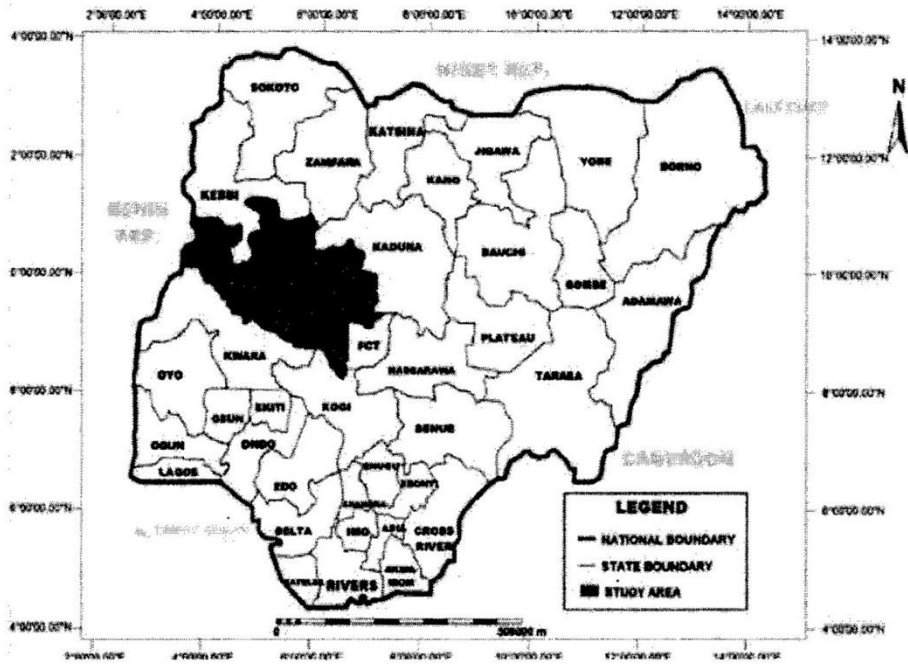
Fig 1. Map of Nigeria showing Niger State.