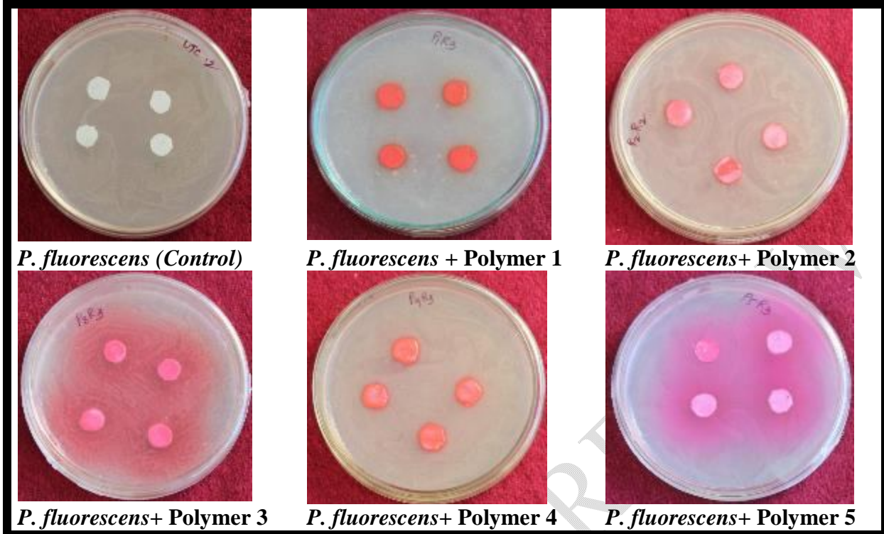
Plate 2: Compatibility of Pseudomonas fluorescens (zones of no inhibition) with commercially available polymers