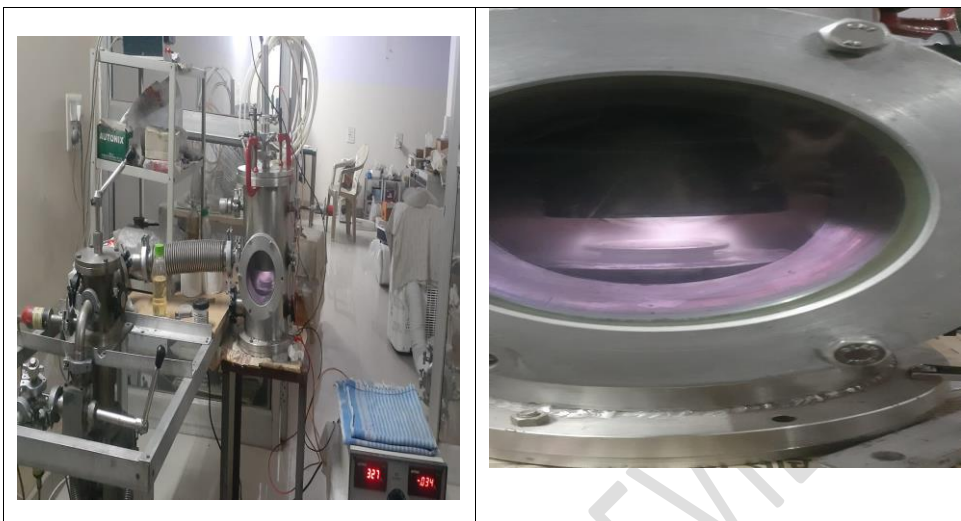
Fig.1 A. plasma discharge treatment chamber B. mustard seeds undergoing in a plasma reactor