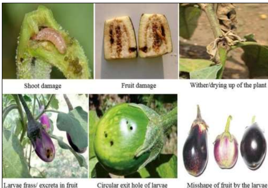
Fig. 2. Nature of damages caused by Brinjal Shoot and Fruit Borer

and exposes the newly developed shoots to harm from larvae. Damaged blooms that are fed on by larvae do not develop into fruit. Damages caused by Brinjal Shoot and Fruit Borer illustrated in Fig. 2.