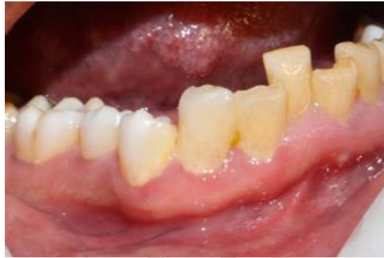
Fig.5: 6 months follow up