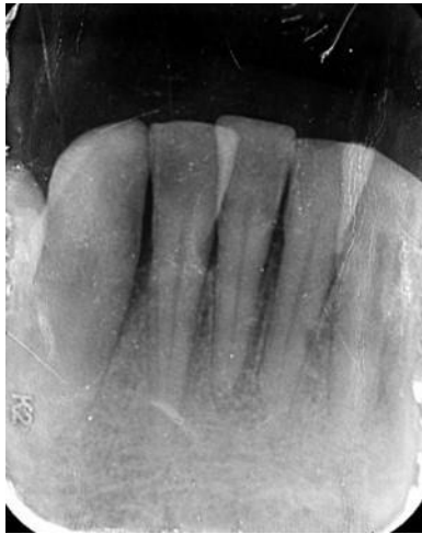
Fig.3 : Immediate post-operative