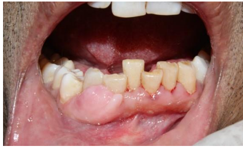
Fig.1: pre-operative intraoral