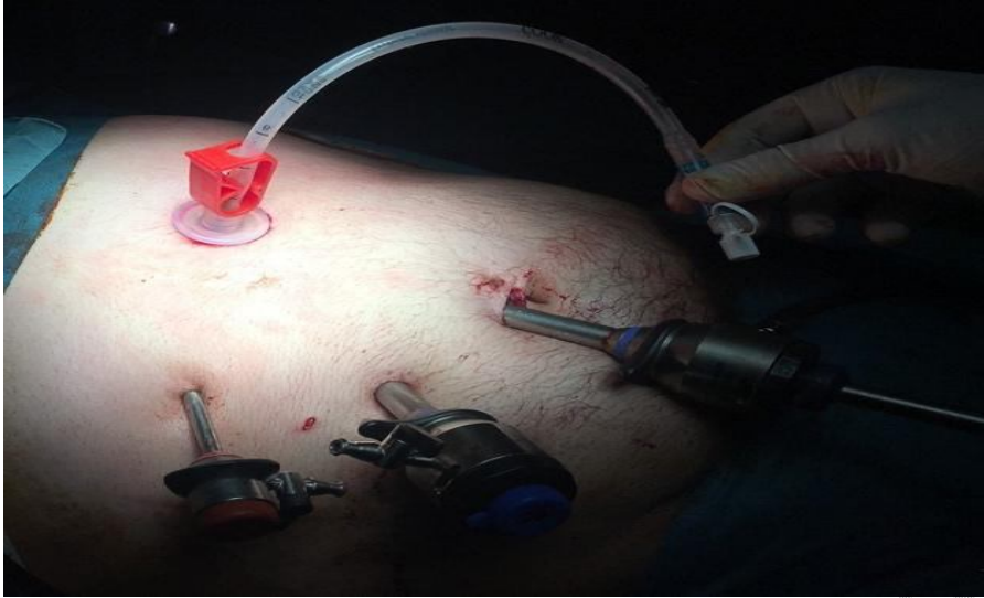
Fig 2: Final result of the gastrostomy and the trocars positions.