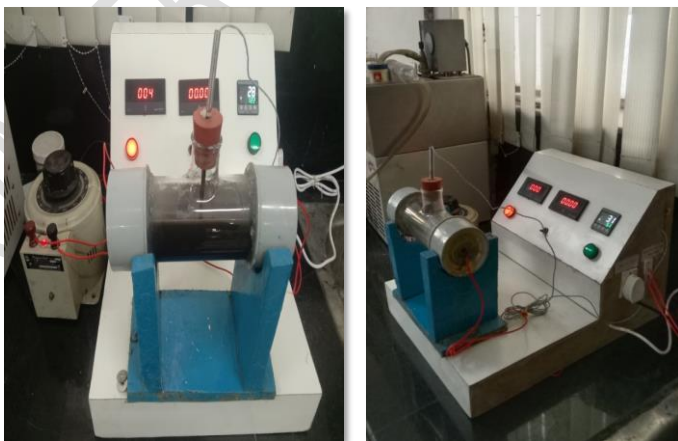
Fig. 1(b). Developed laboratory ohmic heating apparatus for oil extraction from black cumin seed