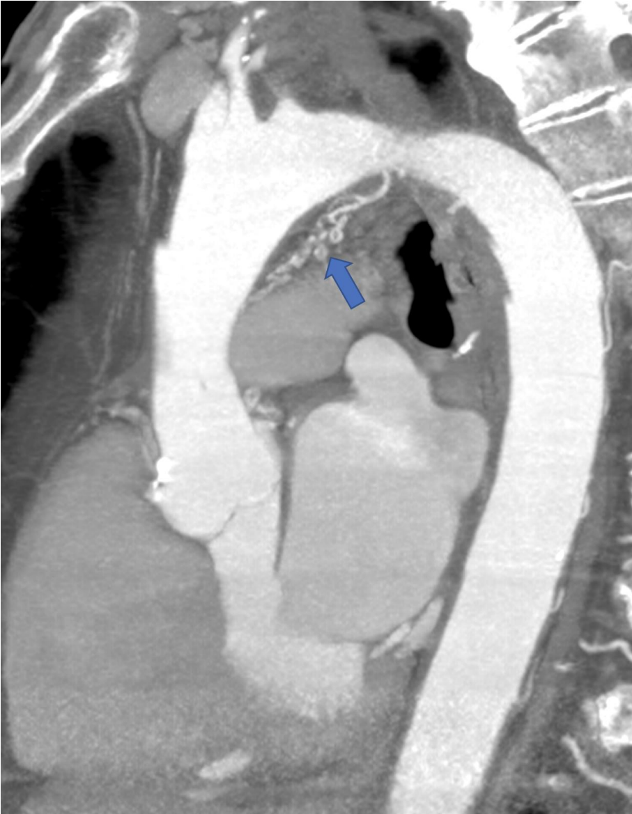
FIGURE 2 : Coronary CT Scan, coronal reconstruction showing the CBF (blue arrow) originating on the lower surface of the aortic arch.