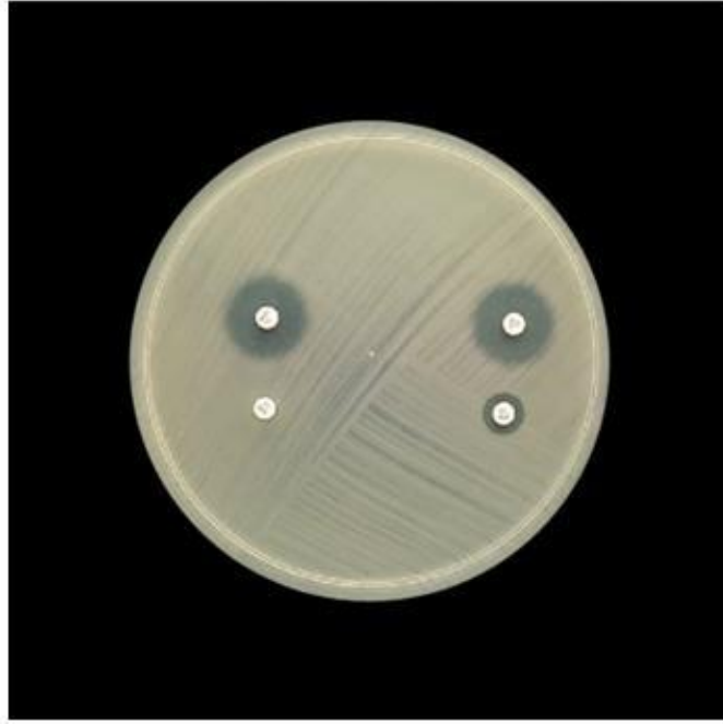
Figure 2: Showing Modified Hodge Test for Metallo \beta -Lactamase (MBL) production