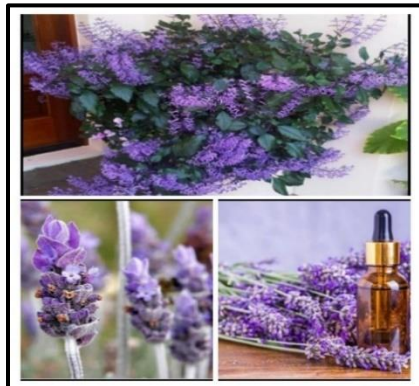
Figure 2: Lavendula angustifolia

The plant's scent is produced by shimmering oil glands embedded in the microscopic plant hairs, or trichomes, that cover the stems, leaves, and flowers of the plant. Taxonomic classification of lavendula angustifolia is: scientific name: lavandula, family: lamiaceae, subfamily: nepetoideae, kingdom: plantae, order: lamiales, tribe: ocimeae.