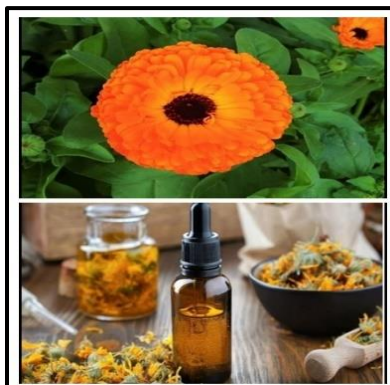
Figure 1: Calendula officinalis

“ Calendula officinalis is a flowering plant in the daisy family asteraceae”. [22,23] “Its florets are edible”. [24] “They are often used to add color to salads or added to dishes as a garnish instead of saffron”. [25] “The essential oil of calendula is high in triterpenoid content which heals dry skin, eczema, and hemorrhoids. Calendula officinalis is widely cultivated and can be grown easily in sunny locations in most kinds of soils”. [26]