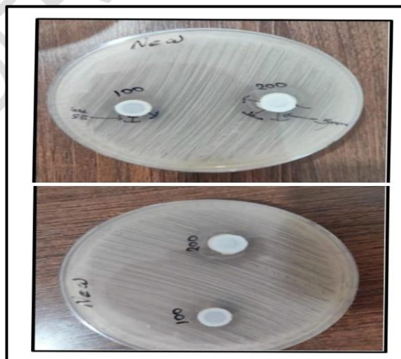
Figure 5: Antifungal activity of Batch 4

Antifungal activity against candida albicans was performed by using the agar diffusion method of batches 1,2 and 4. Batch 2 showed slight activity at different concentrations as shown in the figures. Batch 4 was found to be a better antifungal topical gel as results shown in the figures.