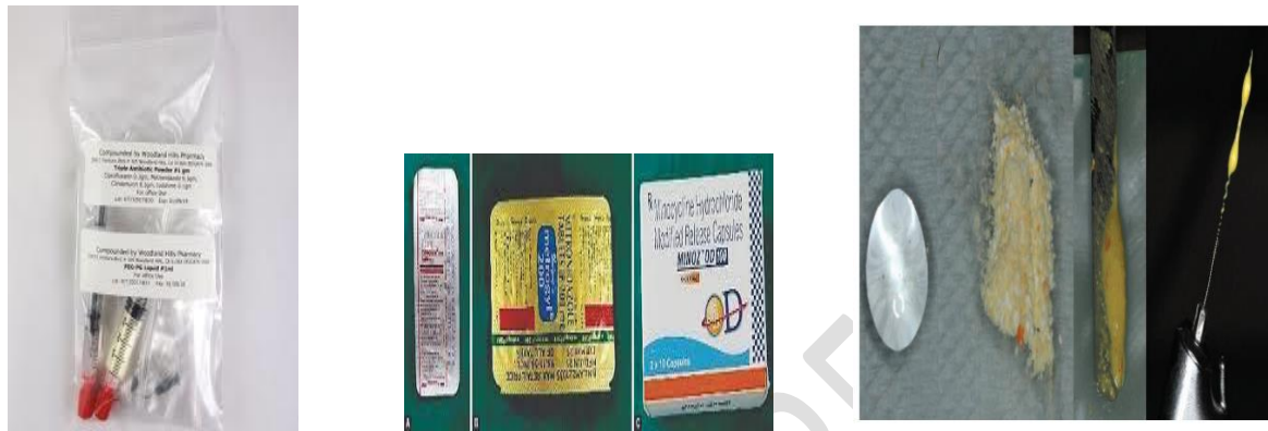
Fig 1-3 : Triple Antibiotic Paste

The use of minocycline in TAP may result in tooth discoloration. Other alternatives are to include using cefaclor and clindamycin in place of minocycline or using DAP without minocycline 21 . Bose et al. report that when triple antibiotic paste is used instead of the other two intracanal drugs (calcium hydroxide and formocresol) for bonding and etching, the thickness of the dental canal walls increases by the largest proportion 3 .