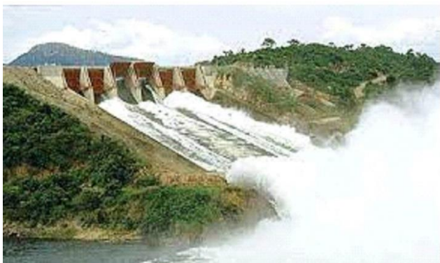
Fig. 1.b Akosombo dam opens spillways.