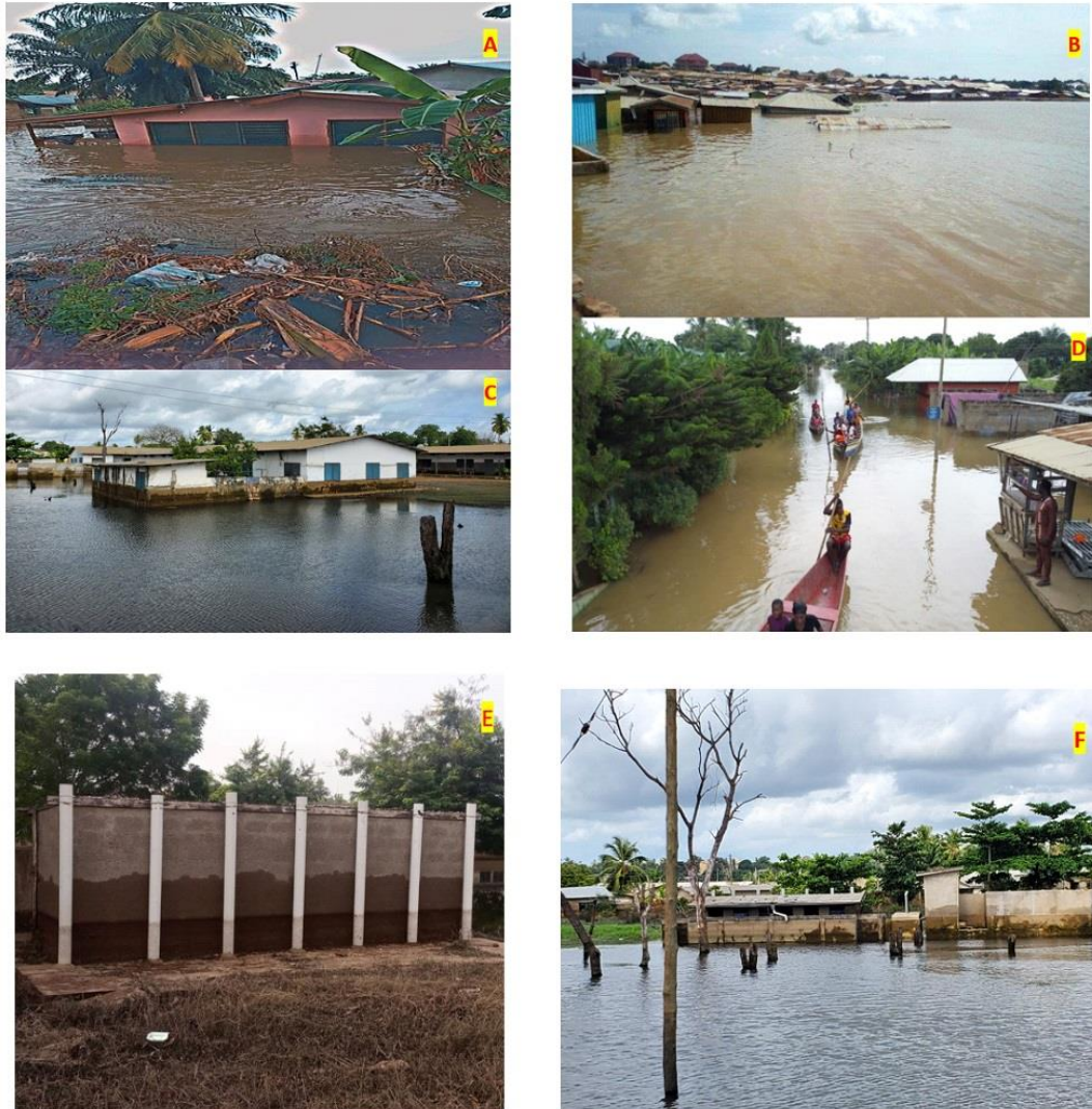
Fig. 4. devastation caused by the flood waters in some affected areas