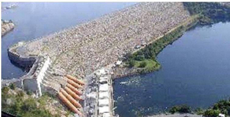
Fig. 1.a Akosombo dam constructed in 1965

This study assessed the negative impacts of the 2023 controlled spillage of the Akosombo and Kpong dams, resulting from increased water inflow, with severe impacts on downstream communities, and the urgent need for comprehensive measures to mitigate the impacts of future disasters and enhance community resilience. The Akosombo hydroelectric dam and the opening of the spillways are shown in Fig. 1.a and Fig. 1.b respectively.