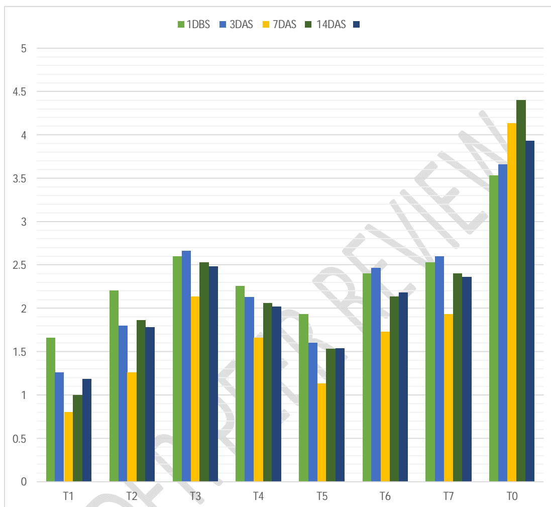
Fig.2.Graphicalrepresentationof(2 nd spray)(Larvalpopulation)

Azadiractin(Neemoil) 5%, Imidacloprid 17.8 SL, Spinosad 45 SC, Fipronil and Bacillus thuringiensis 4%WSP and a control plot, to check the comparative efficacy of different insecticides and bio pesticides against pod borer Helicoverpa armigera larval population and the yield of Cowpea.