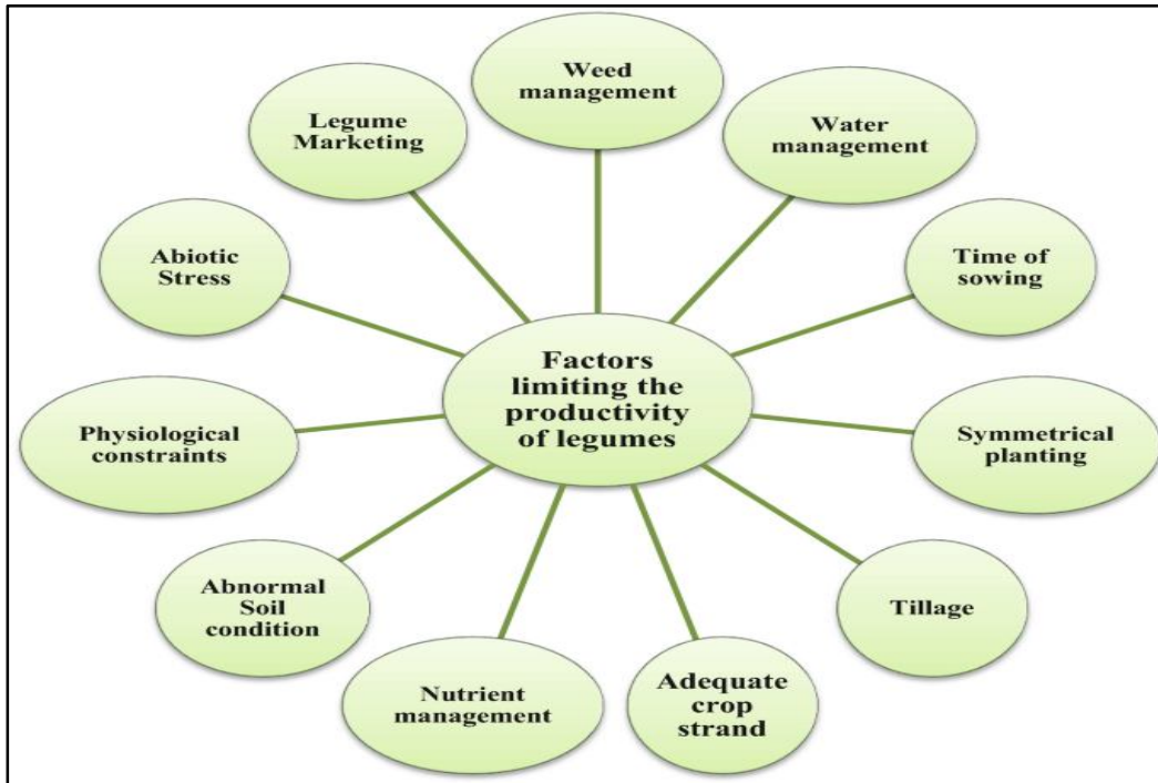
Fig. 2: Factors limiting the productivity of legumes

The productivity of legumes is influenced by a complex interplay of abiotic, biotic, agronomic, environmental, and socio-economic factors. Addressing these challenges requires an integrated approach that combines improved agronomic practices, effective pest and disease management, sustainable nutrient management, and climate resilience strategies. By understanding and mitigating the factors that limit legume productivity, farmers can enhance their yields, contribute to food security, and support sustainable agricultural development.