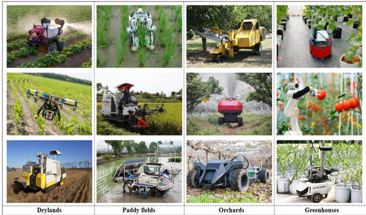
Fig. 1: Different uses of robots in Dryland, field, orchards and greenhouses [11]

Despite the numerous benefits, several challenges impede the widespread adoption of these technologies. High initial costs, technological learning curves, regulatory hurdles, and data security concerns remain significant barriers. Furthermore, the integration of these advanced technologies requires substantial infrastructure and training, which can be particularly daunting for small-scale farmers. Addressing these challenges necessitates strategic investments and supportive policies to facilitate the adoption of smart farming practices. Collaborations between technology developers, agricultural experts, and policymakers are crucial to drive innovation and ensure that the benefits of smart farming are accessible to all farmers, regardless of scale [12]. Such partnerships can help overcome financial and technical barriers, providing the necessary resources and knowledge to implement these advanced technologies effectively.