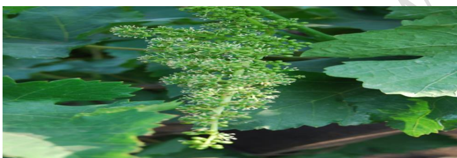
Fig 2 : Stages at 50% Flowering

The growing of the berries and their ripening are the first and second different phases of berry development. Ripening includes a number of coordinated and genetically physiological, biochemical, and developmental processes [23]. Different cultivar of grape having different period of time required for complete development of berry, however, it is possible to anticipate that it will take around 100 days from full blossoming till complete maturity [24].