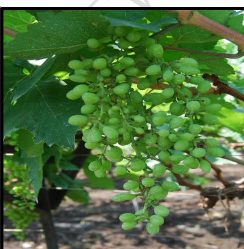
fig 4 : Berry size: 6-8 mm

The another investigation was carried out during 2017-18, 8 th year old grapevine grafted on freedom rootstock grown in a private vineyard, Egypt, Cultivar Red Globe. The research outcomes show that @1ppm GA 3 + Urea treatment greatly enhanced the total number of lateral branches and leaf area as compared to other treatments. (Farid and Ashraf 2019). To improve berry size, GA 3 is applied on grape during fruit set [26]. Crimson Seedless might lose quality from excessive fruit set. Application of GA 3 , trunked girdling and other methods to increase berry size, however, are less successful and may lead to unsatisfactory cluster