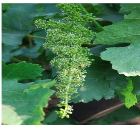
Fig 2 : Stages at 50% Flowering

The growing of the berries and their ripening are the first and second different phases of berry development. Ripening includes a number of coordinated and genetically physiological, biochemical, and developmental processes [23]. Different cultivar of grape having different period of time required for complete development of berry, however, it is possible to anticipate that it will take around 100 days from full blossoming till complete maturity [24].