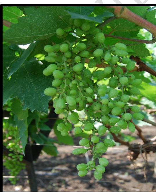
fig 4 : Berry size: 6-8 mm

The another investigation was carried out during 2017-18, 8 th year old grapevine grafted on freedom rootstock grown in a private vineyard, Egypt, Cultivar Red Globe. The research outcomes show that @1ppm GA 3 + Urea treatment greatly enhanced the total number of lateral branches and leaf area as compared to other treatments. (Farid and Ashraf 2019). To improve berry size, GA 3 is applied on grape during fruit set [26]. Crimson Seedless might lose quality from excessive fruit set. Application of GA 3 , trunked girdling and other methods to increase berry size, however, are less successful and may lead to unsatisfactory cluster compactness when fruit set is high. They studied effect of GA 3 with different concentration at