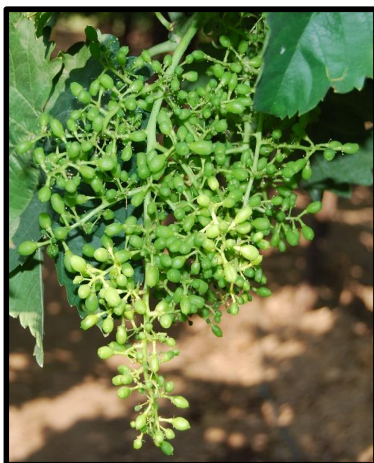
Fig 3 : Berry size: 3-4 mm