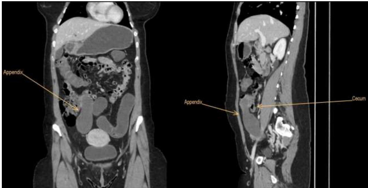
Figure 3. CT images of the mucocele appendix in relation to the cecum