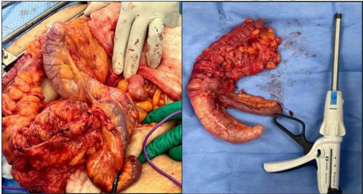
Figure 4. Intraoperative photographs of the appendiceal mucocele