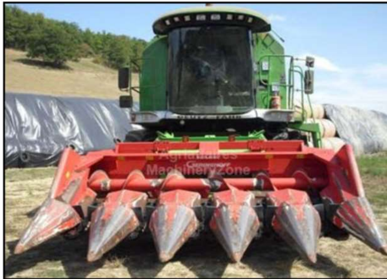
Figure 1. Maize picker [15].

standing crop. After being harvested, the ears are dried using solar radiation before the process of shelling. Figure 1 depicts the diagram of maize picker as shown below.