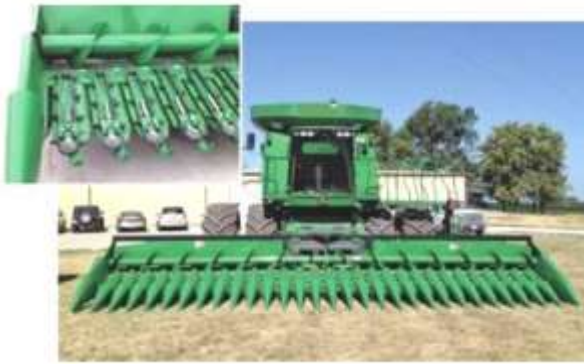
(a) Calmer's 12-inch head

Calmer's maize head has the capability to remove one side of the gearbox in order to construct the narrow head. The solitary collection chain, equipped with larger paddles, directs stalks into the rolls. In addition, the hydraulic stripper plates are added to enable automated regulation of the head height and row-sensing navigation [24]. The narrow-spaced maize head manufactured by Geringhoff is specifically engineered to penetrate a maize field at any given angle. Additionally, it utilizes the Rota Disc cutting technology and a distinctive slanted two-chain design to efficiently gather maize in various row spacings. The narrow-spaced maize head is more effective in harvesting stuck corn than the reel maize head [25]. Figure 4 illustrate the row independent head for maize harvesting as shown below.