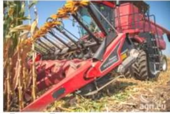
(b) Geringhoff's gathering reel head