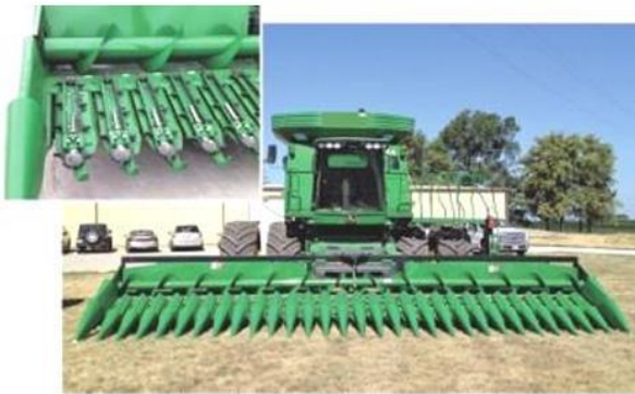
(a) Calmer's 12-inch head

Calmer's maize head has the capability to remove one side of the gearbox in order to construct the narrow head. The solitary collection chain, equipped with larger paddles, directs stalks into the rolls. In addition, the hydraulic stripper plates are added to enable automated regulation of the head height and row-sensing navigation [24]. The narrow-spaced maize head manufactured by Geringhoff is specifically engineered to penetrate a maize field at any given angle. Additionally, it utilizes the Rota Disc cutting technology and a distinctive slanted two-chain design to efficiently gather maize in various row spacings. The narrow-spaced maize head is more effective in harvesting stuck corn than the reel maize head [25]. Figure 4 illustrate the row independent head for maize harvesting as shown below.