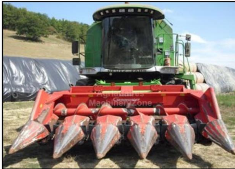
Figure 1. Maize picker [15].

standing crop. After being harvested, the ears are dried using solar radiation before the process of shelling. Figure 1 depicts the diagram of maize picker as shown below.