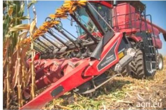
(b) Geringhoff's gathering reel head