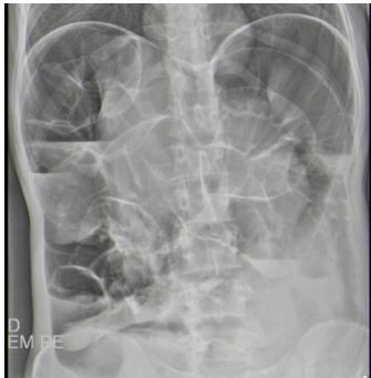
Figure 1: Abdominal X-ray in orthostatism

scan (TC) with intravenous contrast was ordered that showed 'marked distension of the stomach and intestinal loops, compatible with a colon'. 'The possibility of pneumoperitoneum was suggested (Figure 2).