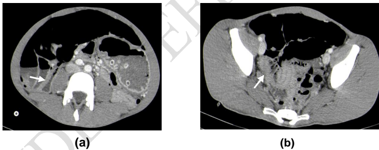
Figure 2: abdominopelvic TC- (a) Mesocolon torsion; (b) Meckel's diverticulum

Comment [LL8]: Please elaborate on where is mesocolon and its torsion