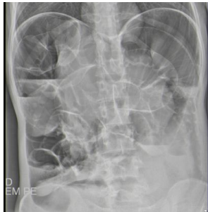
Figure 1: Abdominal X-ray in orthostatism