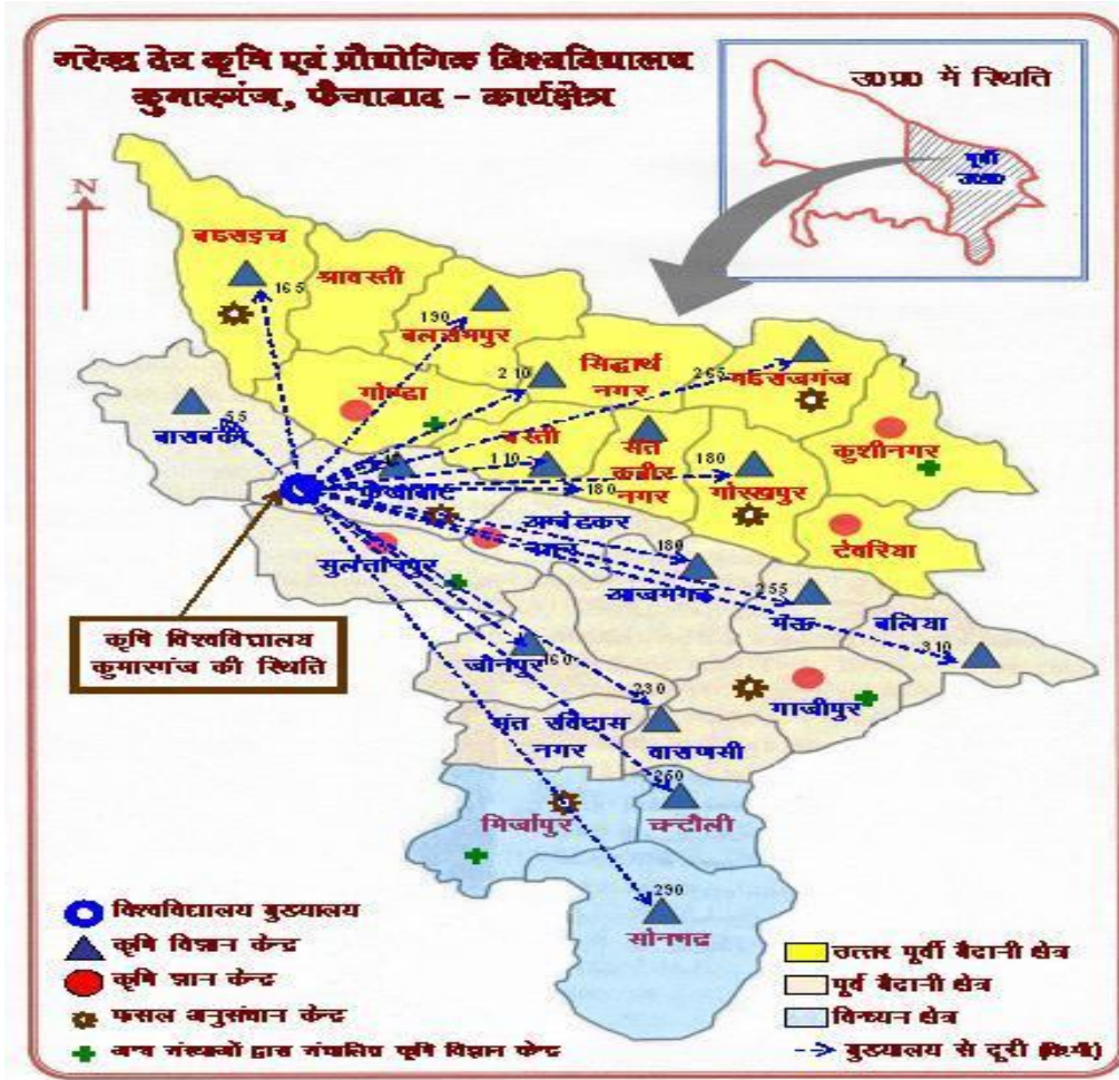
Fig.1 Area of Study