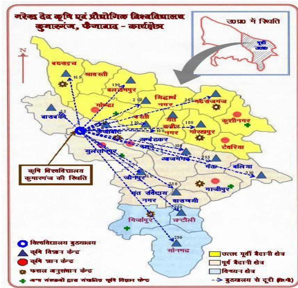
Fig.1 Area of Study