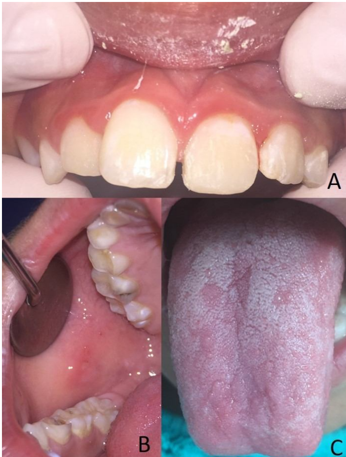
Figure 2: A) localized gingivitis and gingival hyperplasia in the dental organs. B) right cheek an erythematous area. C) Peeling of the taste buds occurs on the tongue.

On intraoral examination, an erythematous area was located in the lining mucosa of the right cheek. On the tongue, peeling of the taste buds, localized gingivitis and gingival hyperplasia in the dental organs occur 11,12,21,22. It is indicated to keep the mucosa hydrated with saliva substitute and Sorensen's solution. It refers to the dermatology department where the application of Triticum vulgare 10g, fusidic acid cream 2%, and application of Vaseline and moisturizing cream is indicated. Figure 2.