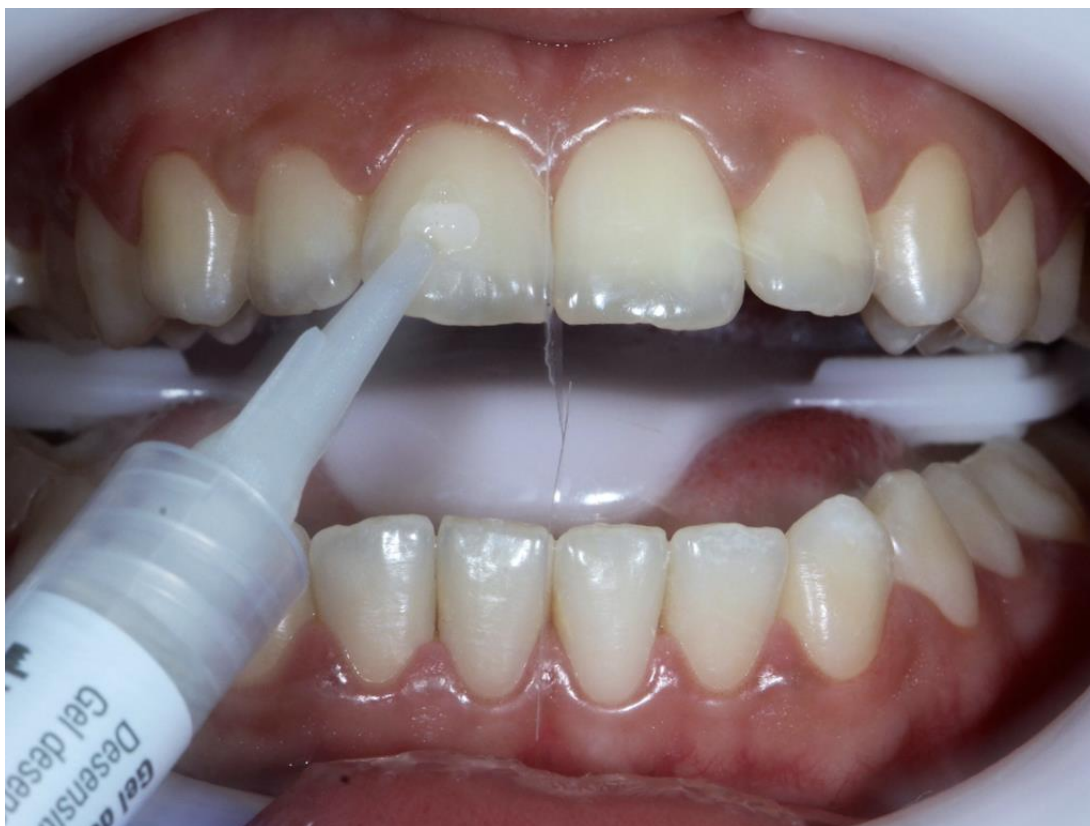
Figure 5. Application of Ozonized Sunflower Oil (Test Group)