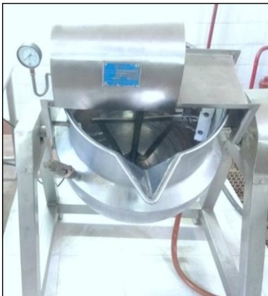
Figure1: Steam jacketed hemi spherical kettle

The scraper assembly of mechanized system is designed with vertical circular agitator with adjustable Teflon scraper blades. The inner shell has stainless steel of 30 mm diameter, which is coupled with 0.25 HP gear motor by motor coupling. There are two scraper blades separately supported by arms to the main shaft. The Teflon blades are adjustable to provide necessary clearance to fix it on the SS strip using nut and bolt. The design is such that the blades sweeps the product settled on the circumference of the inner shell as well as at the bottom of the hemispherical kettle. The design is made hygienic, to facilitate cleaning and to avoid any contamination.