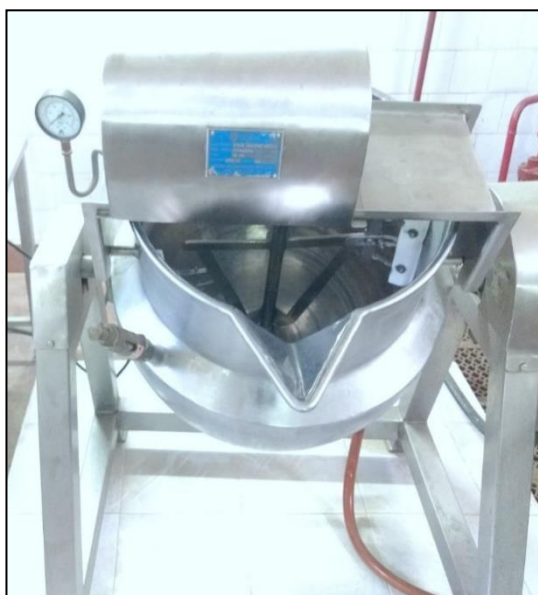
Figure1: Steam jacketed hemi spherical kettle

The scraper assembly of mechanized system is designed with vertical circular agitator with adjustable Teflon scraper blades. The inner shell has stainless steel of 30 mm diameter, which is coupled with 0.25 HP gear motor by motor coupling. There are two scraper blades separately supported by arms to the main shaft. The Teflon blades are adjustable to provide necessary clearance to fix it on the SS strip using nut and bolt. The design is such that the blades sweeps the product settled on the circumference of the inner shell as well as at the bottom of the hemispherical kettle. The design is made hygienic, to facilitate cleaning and to avoid any contamination.