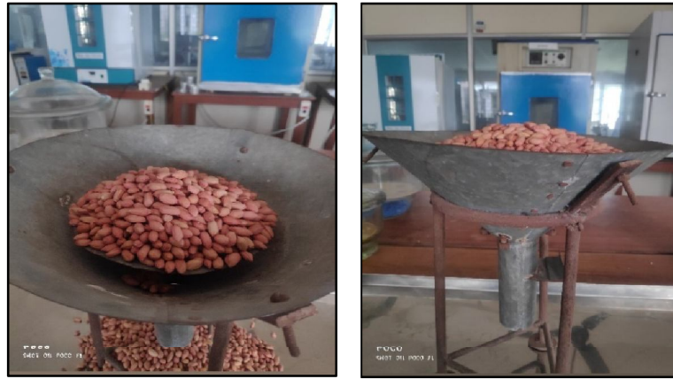
Fig. 7: Measurement of Angle of Repose of groundnut seeds