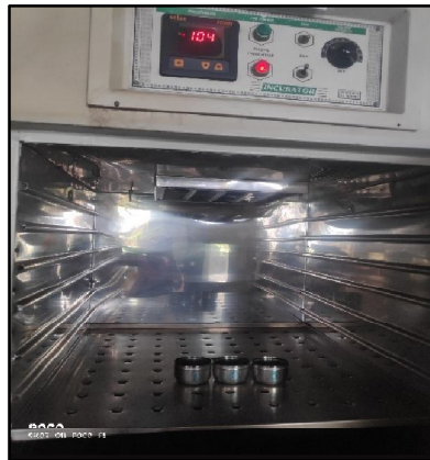
Fig. 4: Measurement of moisture content of sample using hot air oven