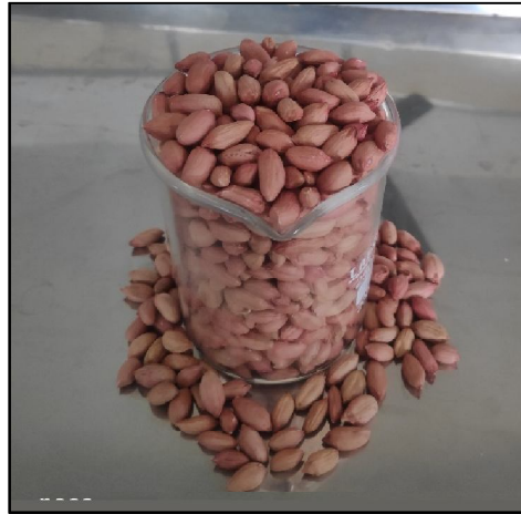
Fig. 5: Measurement of bulk density