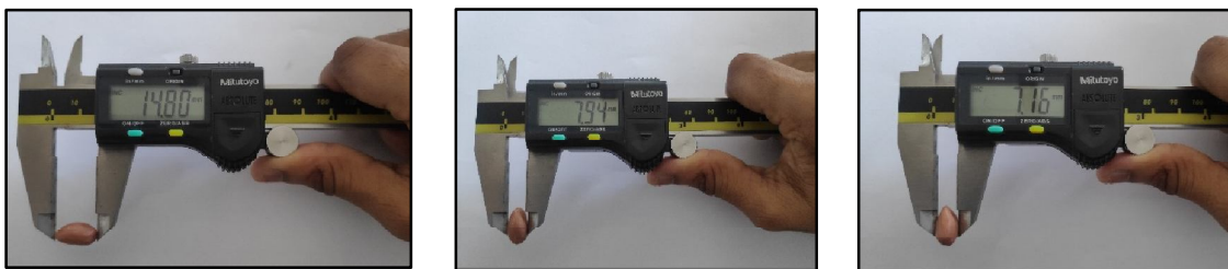
Fig.3: Measurement of axial dimensions of groundnut seed