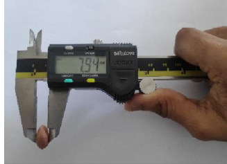
Fig.3: Measurement of axial dimensions of groundnut seed