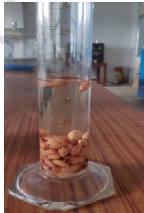
Fig. 6: Measurement of true density with toluene liquid