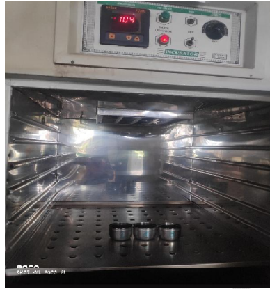
Fig. 4: Measurement of moisture content of sample using hot air oven