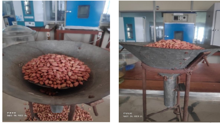
Fig. 7: Measurement of Angle of Repose of groundnut seeds