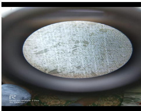
a) Pollen count using haemocytometer under microscope