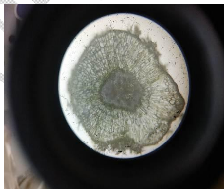
b) Ovule count under