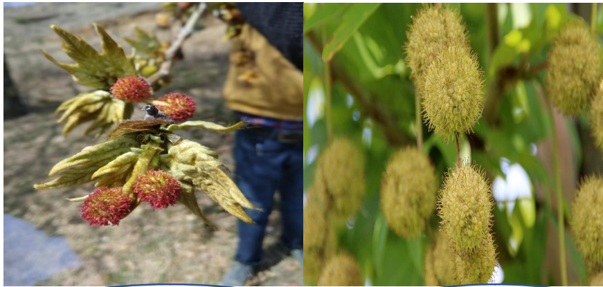
a) Female flower