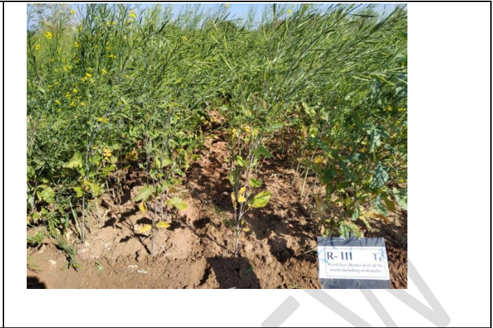
Fig.2 T 8 : Weed free (Removal of allweeds including orobanche )