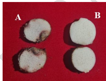
Plate 2. A) Infected and B) healthy corms of Colocasia

Infection can occur on any part of the corm and develop rapidly after harvest. In early stages, the diseased tissue is light-brown, firm and often has a distinct margin and also it is difficult to recognize [8]. Downy whitish growth developed on the surface of the corms. When infected corm sliced, tan colored, rubber-like and soft appearance can be observed. Later an expanding, brown discolored area with a diffuse, indistinct border develops (Plate 2) [5].