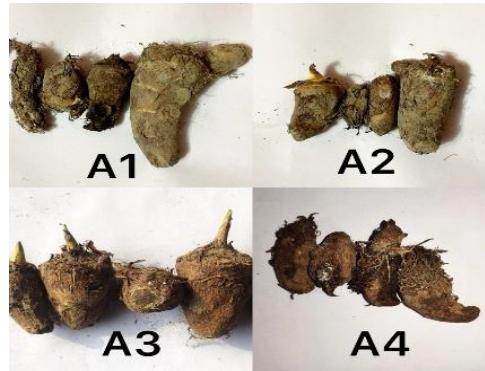
Plate 1. Collected colocasia corms from different markets in Andhra Pradesh