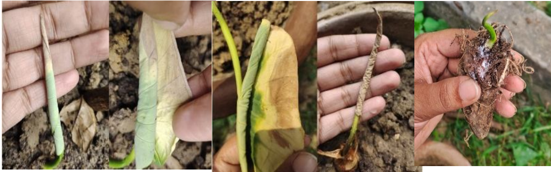
Plate 4. Phytophthora blight and corm rot symptoms of Colocasia (after corm germination)