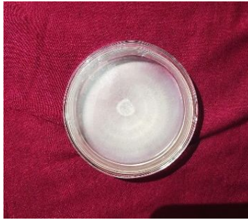
Plate 3. Pure culture of Phytophthora sp.

remove the disinfectant and blotted dry. The sterilized pieces were plated (4 pieces/dish) on carrot agar medium in Petri-dishes under aseptic conditions. Incubated at 25°C for five to ten days for obtaining sufficient quantity of inoculums. Pure culture of Phytophthora sp. (Plate 3) was obtained by sub-culturing.