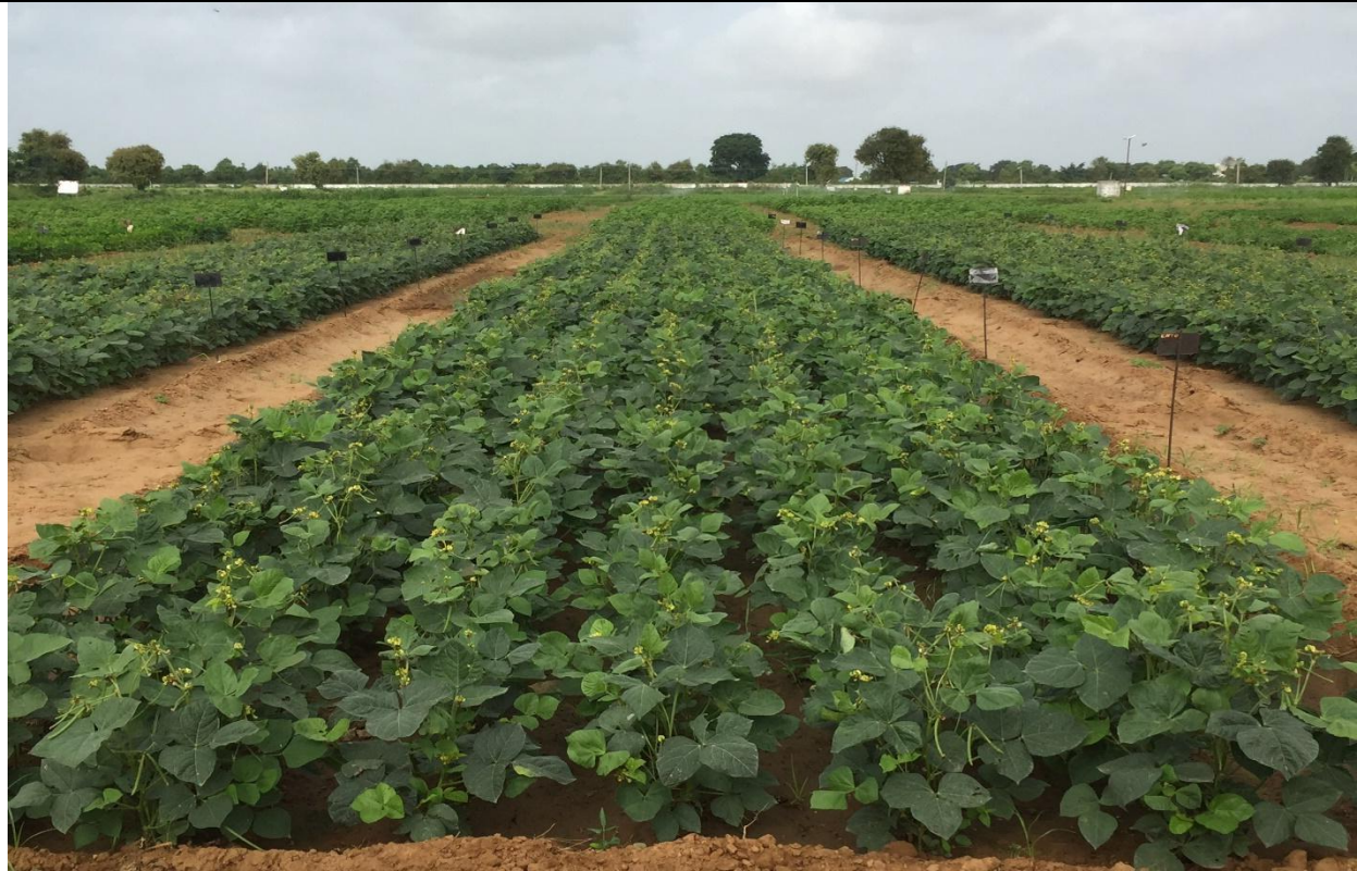
Figure 1A: General view of mungbean field