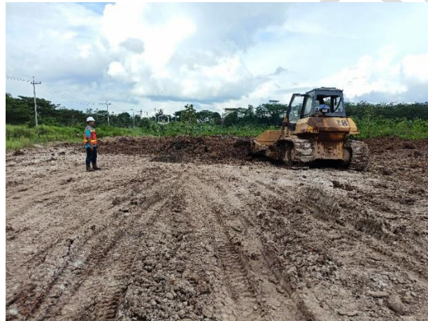
Figure 3. Distribution of soil