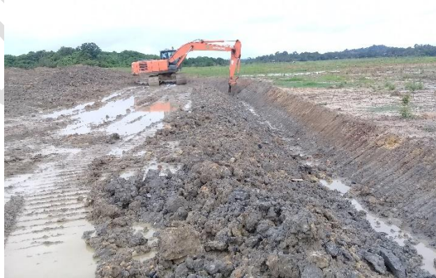
Figure 4. Construction of Erosion Control Channels