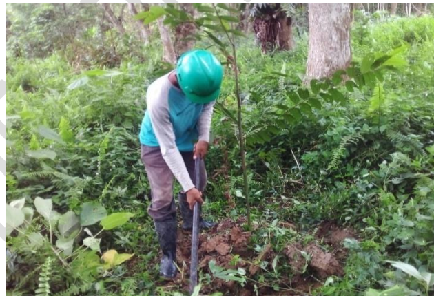
Figure 6. Insertion Planting of Local Plants

The target number of reclamation plants per hectare is 625 fast-growing plants and 300 local-type insert plants. So the total number of plants per hectare of the reclamation area is 925 plants. Fast-growing plants are Albizia saman , Hibiscus tiliaceus L., Senna siamea , Enterolobium cyclocarpum , Paraserianthes falcataria , and Gmelina . Local plants are Arenga pinnata , Tamarindus indica , Pterospermum javanicum , Shorea laevis , Lagerstroemia speciosa , Agathis dammara , Duabangamoluccana , Durio zibethinus , Aquilaria malaccensis , Melaleuca leucadendra , Nauclea orientalis , Neolamarckiacadamba , Psidium guajava , Calliandra calothyrsus , Dryobalanops aromatica , Reutealis trisperma , Dipterocarpus acutangulus , Terminalia