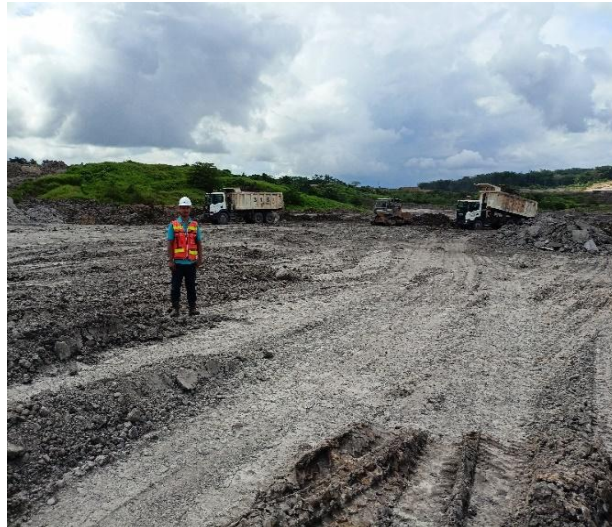
Figure 2. Cover filling