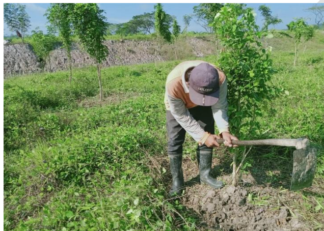
Figure 5. Planting Fast-Growing Plants

The species planted as pioneer plants are fast-growing plants with a planting distance of 4 m x 4 m. Planting is carried out in planting holes measuring 40 cm x 40 cm x 40 cm filled with manure and compost. The planting distance for fast-growing plants is 4 m x 4 m. After the plants are 3 years old, proceed with planting insert plants with local plant species from Kalimantan with a spacing for insert plants of 4 m x 8 m.