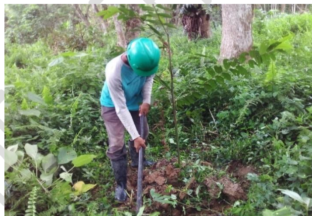
Figure 6. Insertion Planting of Local Plants

The target number of reclamation plants per hectare is 625 fast-growing plants and 300 local-type insert plants. So the total number of plants per hectare of the reclamation area is 925 plants. Fast-growing plants are Albizia saman , Hibiscus tilliaceous L. , Senna siamea , Enterolobium cyclocarpum , Paraserianthes falcataria , and Gmelina . Local plants are: Arenga pinnata , Tamarindus indica , Pterospermum javanicum , Shorea laevis , Lagerstroemia speciosa , Agathis dammara , Duabanga moluccana , Durio zibethinus , Aquilaria malaccensis , Melaleuca leucadendra , Nauclea orientalis , Neolamarckia cadamba , Psidium guajava , Calliandra calothyrsus , Dryobalanops aromatica , Reutealis trisperma , Dipterocarpus acutangulus , Terminalia catappa , Vitex pubescens Vahl , Macaranga bancana , Swietenia macrophylla , Mangifera indica , Alse odaphne insignis , Shorea leprosula , Shorea assamica , Shorea acuminatissima . Palaquium rostratum ,