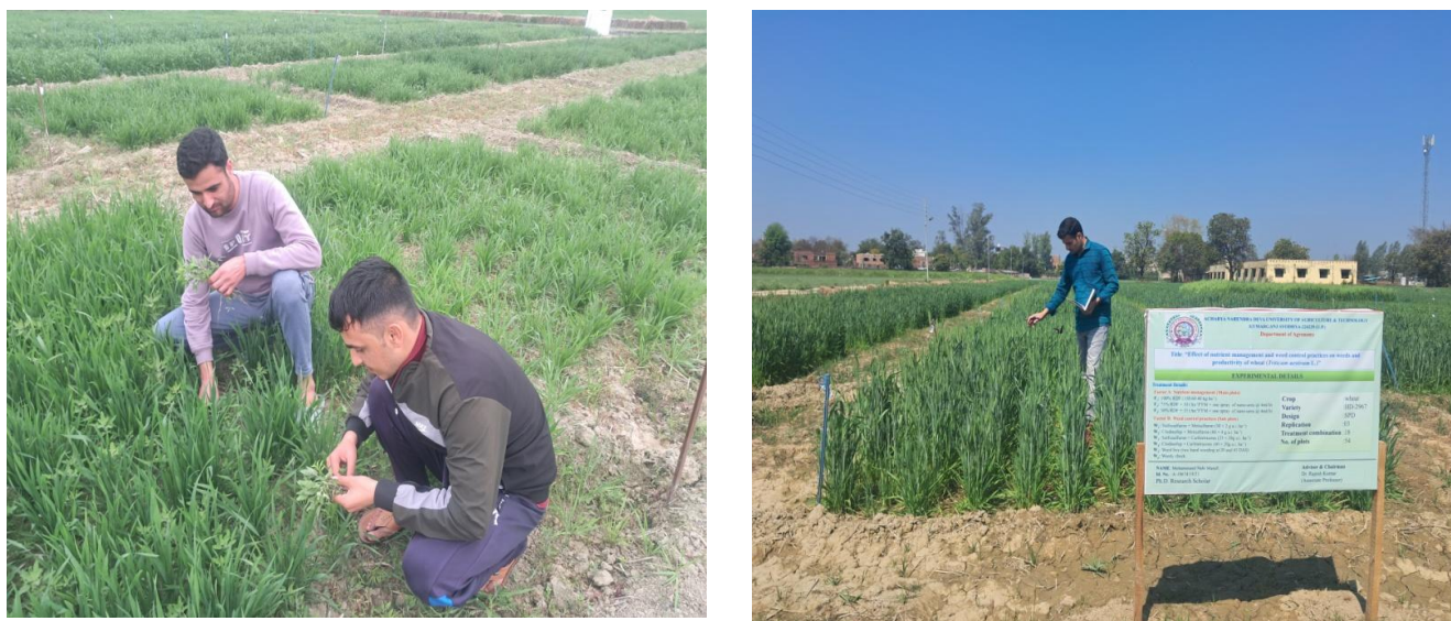
Fig 2: Collecting and counting of weed flora from experimental field.

From the overall studies, it can be concluded that application of 75% RDF + 10 t ha -1 FYM + one spray of nano-urea @ 4ml/lit with the spraying of herbicide Clodinafop + Metsulfuron (60 + 4 g a.i. ha -1 ) found superior for effective control of weeds, weed control efficiency and less yield reduction( weed index) in such treatments.