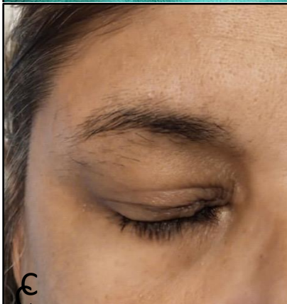
Figures: A- Clinical presentation reveals a significant mass on the right upper eyelid. The predominant clinical manifestation is a painless, firm, sessile to round. The skin overlaying the lesion typically appears smooth and displays reasonable mobility. B- Perioperative imaging of the removal of a sebaceous carcinoma mass from the upper eyelid C- 2 weeks post-operative and two weeks after surgical resection of the tumor and reconstruction of the eyelid.