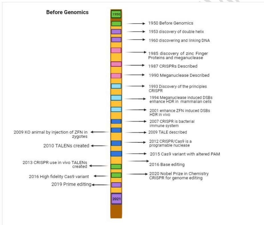
Figure 1: CRISPR/Cas9 technology has witnessed many important discoveries and developments.