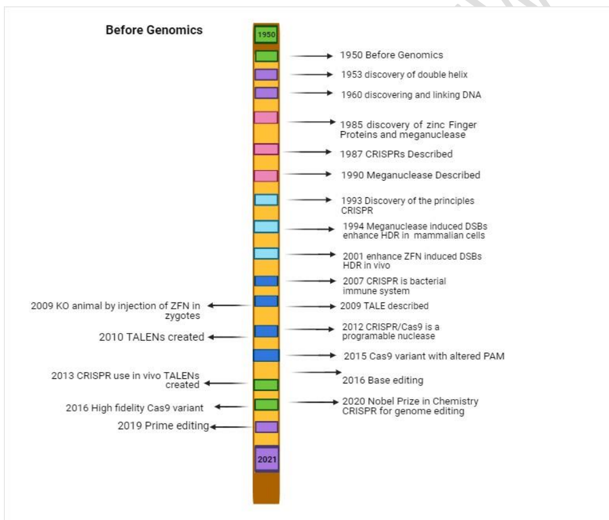
Figure 1: CRISPR/Cas9 technology has witnessed many important discoveries and developments.

The disclosure that Streptococcus thermophilus can foster protection from a bacteriophage by embedding a piece of the irresistible infection's genome into the CRISPR locus has given the initial trial knowledge into the working of the CRISPR framework (Doudna and Charpentier 2014; Samso et al. 2015). As a result of their discovery, Danisco began utilizing CRISPR systems to "vaccinate" bacterial cells in 2005, and the authors received one of the first patents in the field (Isaacson, 2021). A brief history and evolution of CRISPR System is illustrated in figure 1.