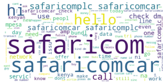
Figure 1: A Word Cloud of Frequently Used Words.

By systematically removing extraneous elements and noise, the resulting dataset was optimized for accurate sentiment analysis.