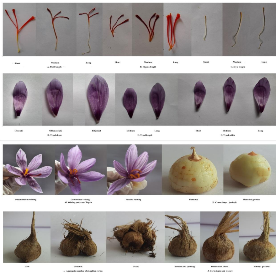
Figure 2: Morphological characterization (floral and corm traits) of saffron germplasm lines