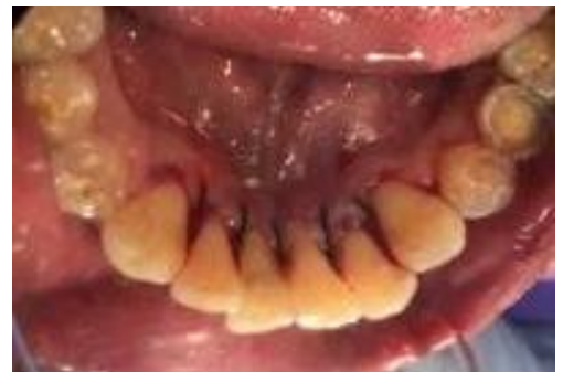
After treatment 90 day