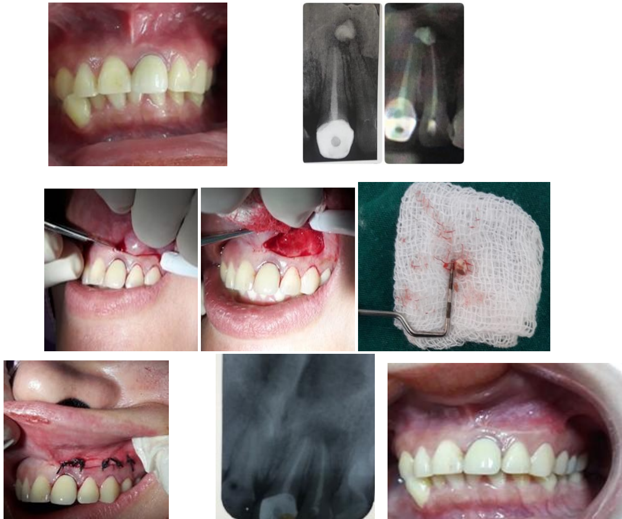
After treatment 90 day