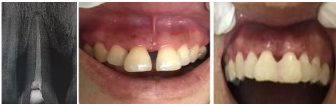
Picture 2: Compared before and after treatment Group2: Root canal filling combined with periodontal open flap