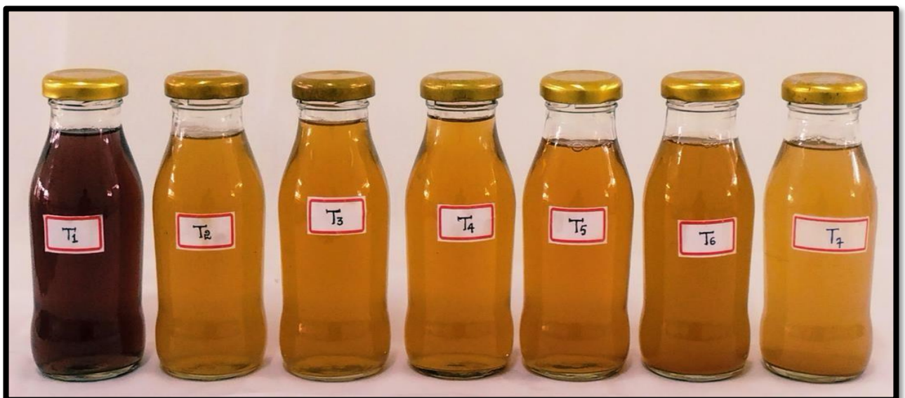
Plate 1: Herbal tea prepared from different blends of rose