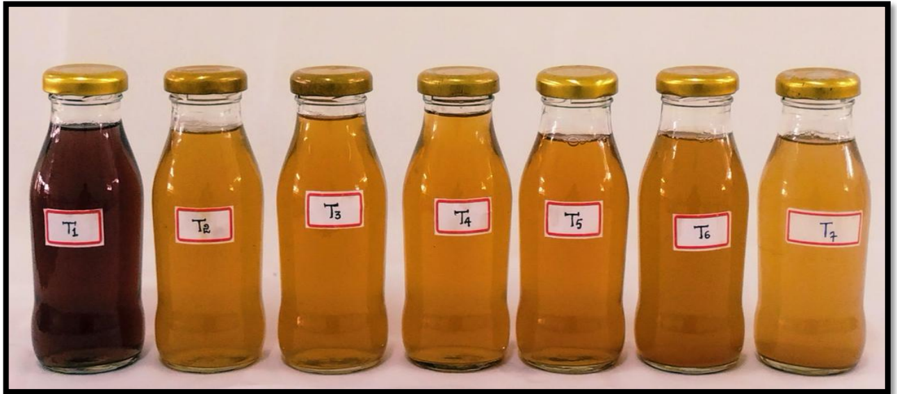
Plate 1: Herbal tea prepared from different blends of rose