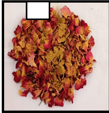
Plate 2: Dried rose herbal tea blended product