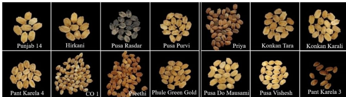
Plate 1. Variation among the seeds of 14 bitter gourd genotypes.

The mean values of germination percentage, days taken for germination, and survival percentage values of replications were analysed following the method given by Panse and Sukhatme(1985). The significance of the differences among all the treated lines was tested by a F-test using the error variance. The complete data was analysed using Complete Randomized Design (CRD) and OP-Stat software.