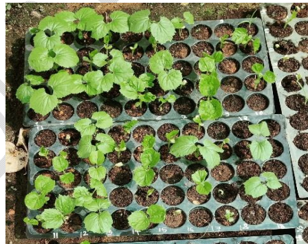
Plate 2. Variation in germination among different bitter gourd genotypes.