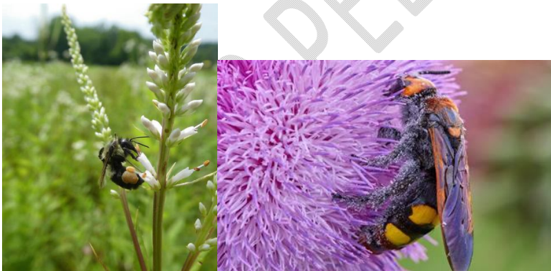
Fig 2. Pollination

seeds. Approximately fifty percent of angiosperms are classified as being in this group[69]. As a result of the geographical or temporal separation of their reproductive organs, self-compatible plants sometimes have an obligatory dependency on pollen carriers. The majority of plants that are self-compatible engage in mixed mating and lie somewhere along a continuum that extends from selfing to outcrossing[70]. It is estimated that around half of all plant species require cross-pollination in order to produce seeds. This process contributes to increased seed production and improved performance of offspring in a great number of self-compatible species. This is due to the fact that cross-fertilization lessens the chance of inbreeding depression and encourages the accumulation of genetic variety, which in turn enables plant species to adapt to new and shifting environments[71]. Studies that involved the supplementary hand-pollination of flowers have demonstrated that the amount and quality of pollen that plants receive naturally is frequently the limiting factor in the amount of seeds that they produce. This phenomena takes place naturally in environments that are generally undisturbed, but it is made worse when plant populations become tiny and fragmented. Plants that are not compatible with themselves are more likely to encounter pollen restriction than plants that are compatible with themselves[72].