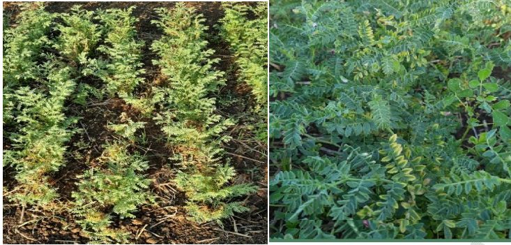
Fig 2: Plant injuries observed in the field by (T1) Topramazone treatment