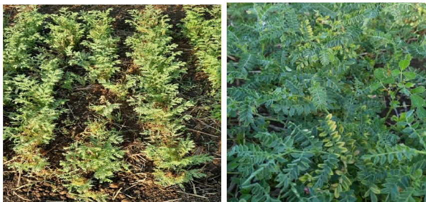
Fig 2: Plant injuries observed in the field by (T1) Topramazone treatment