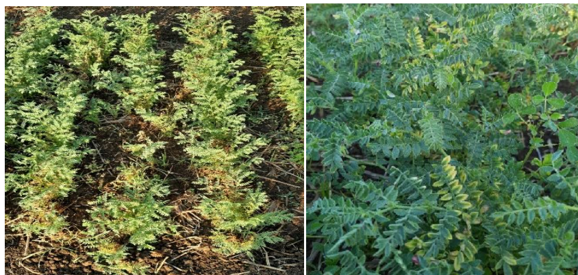
Fig 2: Plant injuries observed in the field by (T1) Topramazone treatment